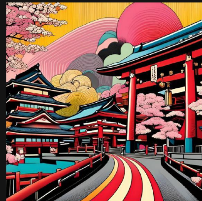
KANDA MYOJIN SHRINE (5 - 6 Mar)