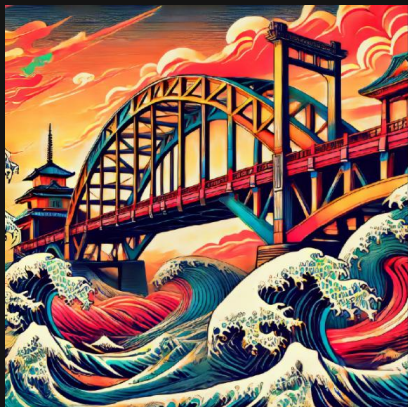
BELLESALLE NIHONBASHI (3 - 4 Mar)