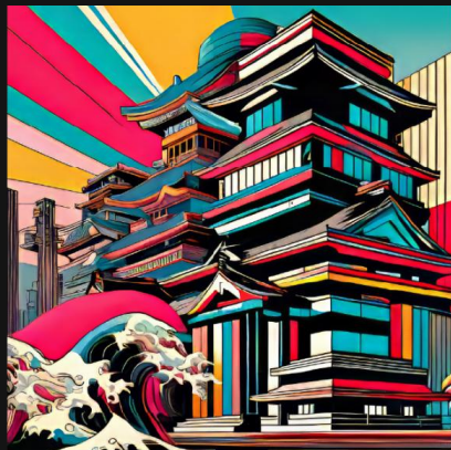
TOKYO STOCK EXCHANGE (4 Mar)